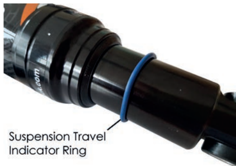
Indicator Ring (Diagram 7)

Air pressure is filled to 150psi during production. Increasing the air pressure will make the shock harder while decreasing the air pressure will make shock softer.