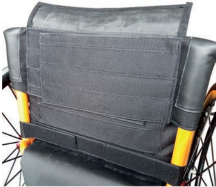
Backrest upholstery (Diagram 3)

The backrest and seat can be adjusted for tension so the user can determine the amount of support they require. Shown below are the areas for adjustment. These consist of hook and loop straps. These can be undone and re-fixed to allow more 'sag' or tightened to provide more support.