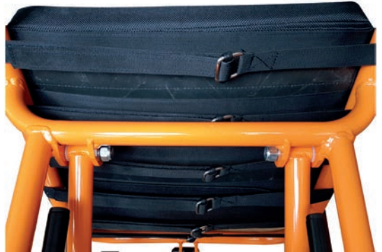
Seat upholstery (Diagram 4)