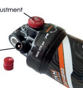
Rear Shock (Diagram 6)