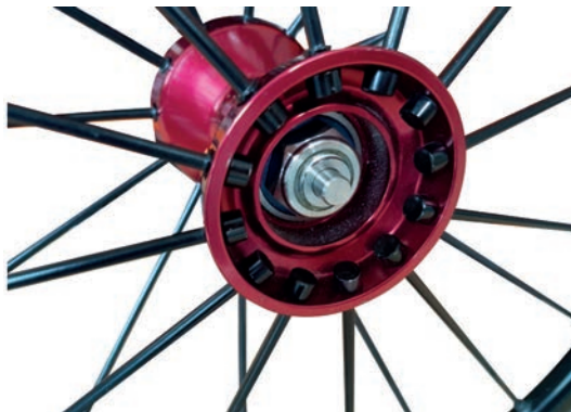
Quick Release Button (Diagram 5)

Before use, always ensure the wheels are secure and the release button is in the 'out' position.