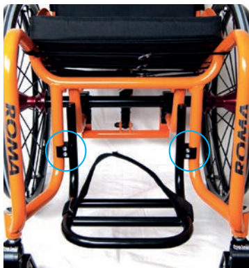
Footrest (Diagram 1)

To adjust the position, loosen the four bolts on the underside of each axle mounting clamp and adjust to the preferred position. Each side must be on the same position indicator mark and then re-tighten the bolts on the clamps.