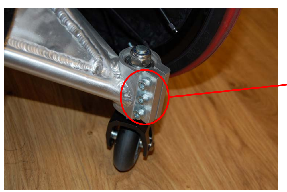
Note - Take care not to overtighten!

Using a 6mm allen key simply slacken 3 allen screws, slide inner socket up or down to set height and retighten